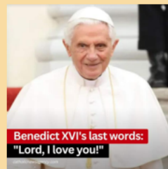
Benedict XVI's last words: "Lord, I love you!"